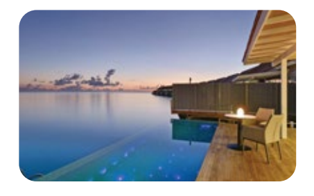
16 Thundi Water Villas with Pool - 142 sqm

Set right at the edge of the beach, enter the Pool Villas through your own private courtyard. The bedroom boasts views out to the infinity pool (18sqm) matching the picturesque vista beyond. The villa is furnished with a walk-in wardrobe and an indoor bathroom complete with a free standing bath, twin vanity, and a separate outdoor rainfall shower.