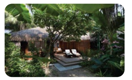
33 Beach Villas with Jacuzzi - 90 sqm

Facing the turquoise lagoon, these villas feature oversized wooden decks with sunloungers, sun umbrella and daybed. The bedroom features a king-sized four-poster bed and a built-in sunlit daybed. The bathroom has a bath/shower, twin vanities, and a large outdoor area with a rainfall shower, outdoor daybed, and an inviting jacuzzi on an elevated deck.