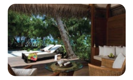
31 Deluxe Beach Villas with Jacuzzi - 95 sqm

The Beach Villas are individual villas hidden within the abundant vegetation, yet only a few steps away from the beach. Facing the lagoon side of the island, they feature king-sized four-poster beds, wooden decks at the front with daybed and sunloungers. The Beach Villas also include semi-open air bathrooms with outdoor rainfall shower.