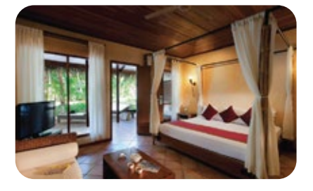
71 Beach Villas - 70 sqm

These villas are contemporary in design. Round in shape, the villa includes a wooden deck featuring an alluring built-in outdoor daybed and sunloungers. The bedroom is spacious and minimalist, displaying a modern king-sized low bed as the centrepiece. The open air bathroom leads to an outdoor jacuzzi. The added luxury of an espresso machine with complimentary refill is included from this villa category upwards.