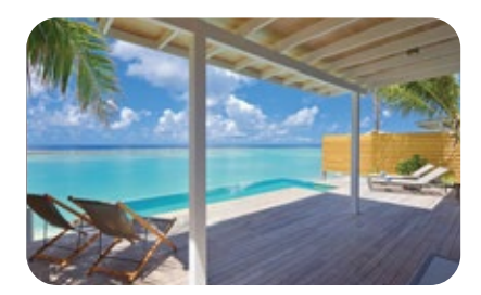
12 Pool Villas - 165 sqm

The Water Villas with Pool are located either in the crystal clear lagoon or facing the house reef, all featuring modern interiors similar to the Deluxe Water Villas. These villas also include a private pool (18sqm) overlooking the ocean.