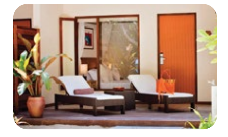
12 Garden Villas - 45 sqm

Check-in is at 14:00hrs, check-out is at 12:00hrs.