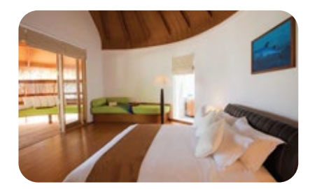
35 Superior Beach Villas with Jacuzzi - 90 sqm

With four built together, the Garden Villas are simple yet stylish and feature a semi-open air bathroom with rainfall shower. Close to the beach and the pristine blue waters, they provide for our most affordable Kuramathi experience.