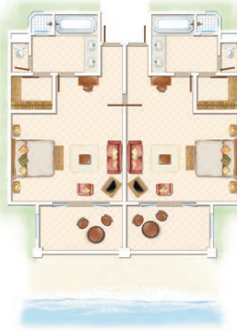
Deluxe Family Apartment