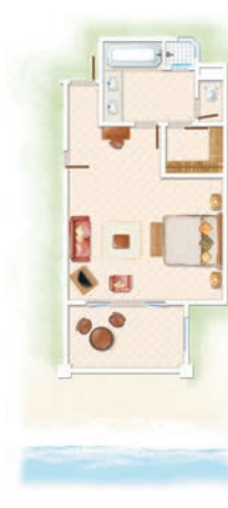
Deluxe Room / Deluxe Ground Floor